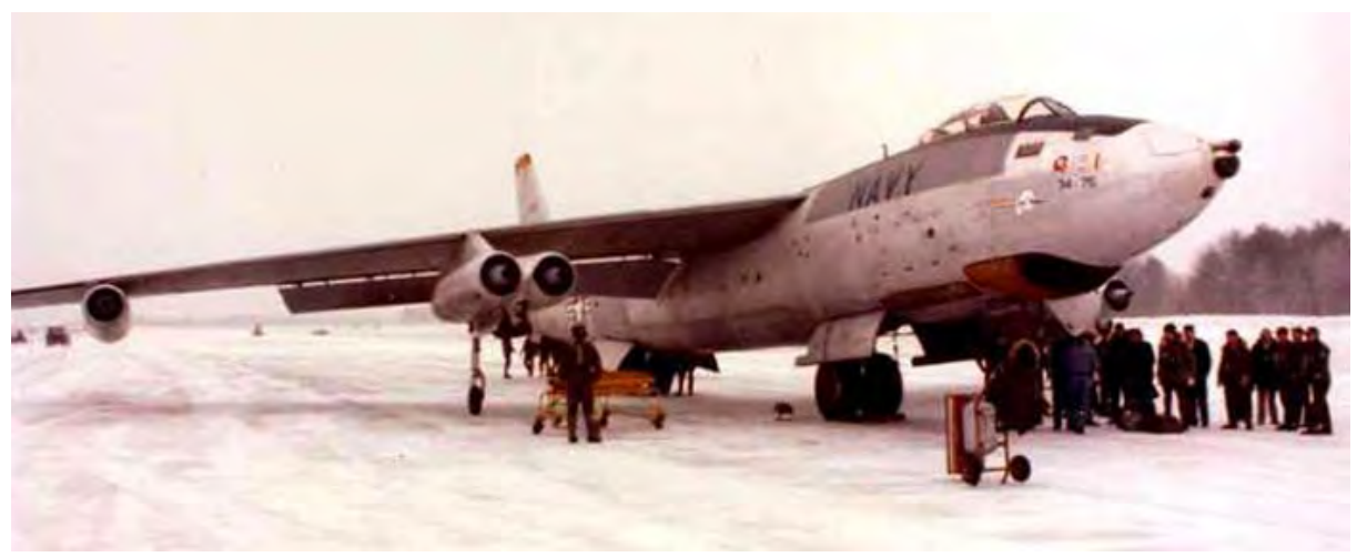
Early spring in Goose Bay, Labrador

For those of you who have been to Goose Bay, Labrador, in February know how cold it gets. The Navy chose this month to 'winter' test the Talos fire control system on their latest missile ship. This ship would be north -west of Greenland in position to fire a missile at a Firebee we would launch at 30,000 feet. Although the temperature at Goose Bay was 20 degrees below zero the ship could not find weather and sea cold enough to adequately conduct their tests. After four days they used fire hoses to spray icy water over the system and we successfully launched the Firebee. As usual we never received the results. On the return trip as I was flying, the rudder-elevator hydraulic system totally failed and the emergency landing at Selfridge AFB, in Detroit was 'interesting'. Lots of slop in elevator control and steering during the taxi phase was very difficult.