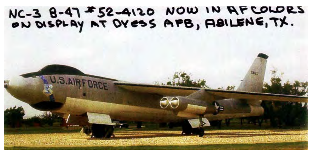
EB-47E 52-412 at DYESS AFB TX NC-4

The original NC-3, B-47 #52-4120 flew with Douglas until 1977, then flown to Abilene, TX and is on display with AF markings (see picture) at Dyess AFB.