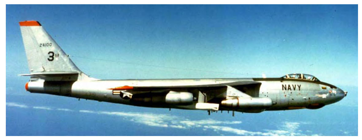
EB-47E 52-4100 #3 NC3