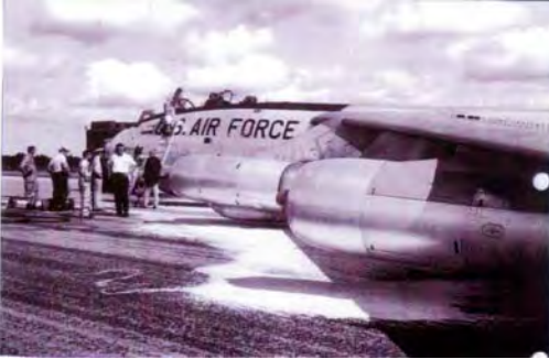
B-47, NC-3, #52-4120 Belly Landing

While I was busy flying A-3's, a B-47, NC-3, #52-4120 was having difficulty extending its landing gear for landing at Cecil NAS in Jacksonville, FL Bob Stevens was the pilot. The forward landing gear would not extend but the rear and outriggers did. B-47 landing gear is electrically operated with a cable operated back up system manually operated by