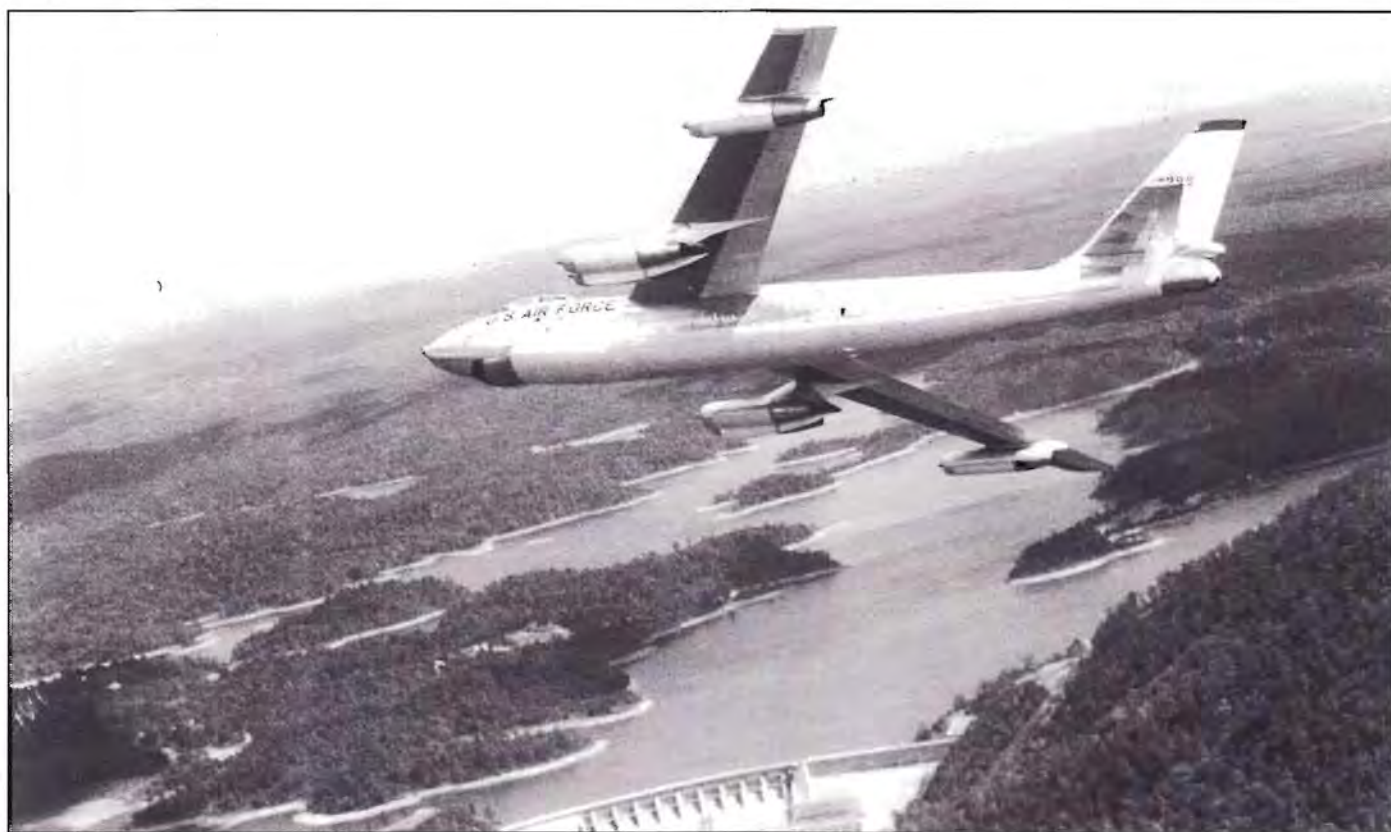
B-47E, 51-2395, served with the 43rd, 97th, 320th, and 96th Bomb Wings.

Non Profit U.S. Postage PAID Brenham, TX 77833 Permit No. #84