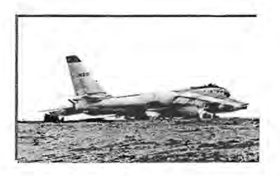
B-47E s/n 15223 of 341st BW at Greenham Common 1960