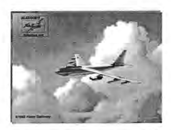
"Strategic Air Command's B-47 Stratojet"

NOTE: A few special edition Galloway prints, signed by Brig. Gen. Jimmy Stewert are still available at $1,000 each.