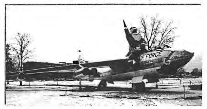
Newsletter of the B-47 Stratojet Association