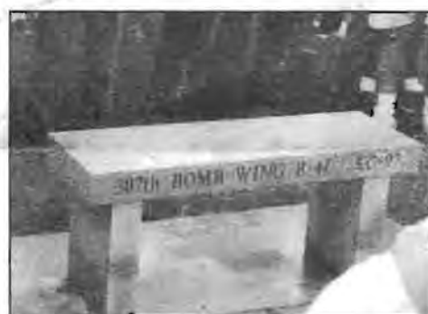
The 307th memorial bench at Veteran's Park.

The Air Force memorial wall eagle at the Air Force Academy was donated by former prisoners of Stalag Luft III on 12 May 1995. The 307th BW memorial plaque was dedicated in 1998.