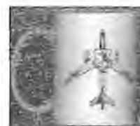
Mug - Association "Horn Button" emblem on reverse side - $10.00