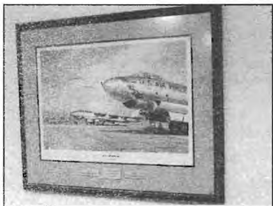
The Lincoln print with the small plaques on the mat below.