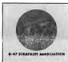
Association Mouse Pad $3.00