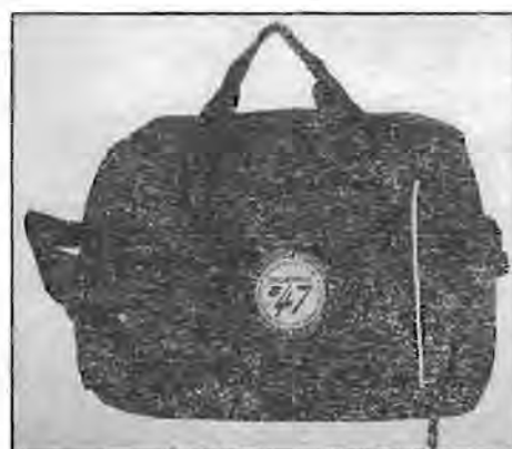
Association T-Shirt With Pocket - $17.00 (Size -M,L,XL)