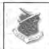
1000 Hour Pin - $25.00