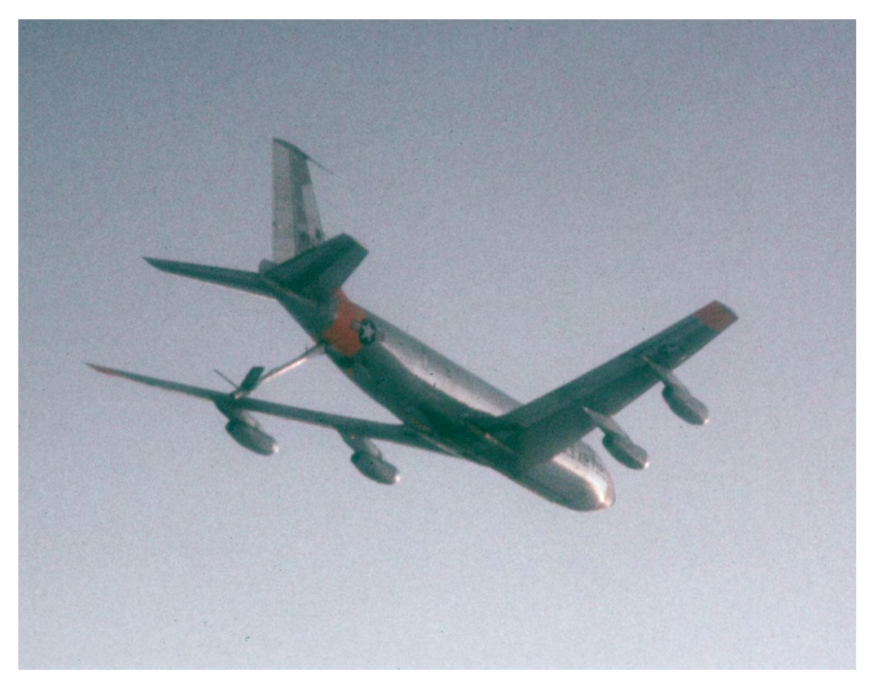
Our tanker en route to England.