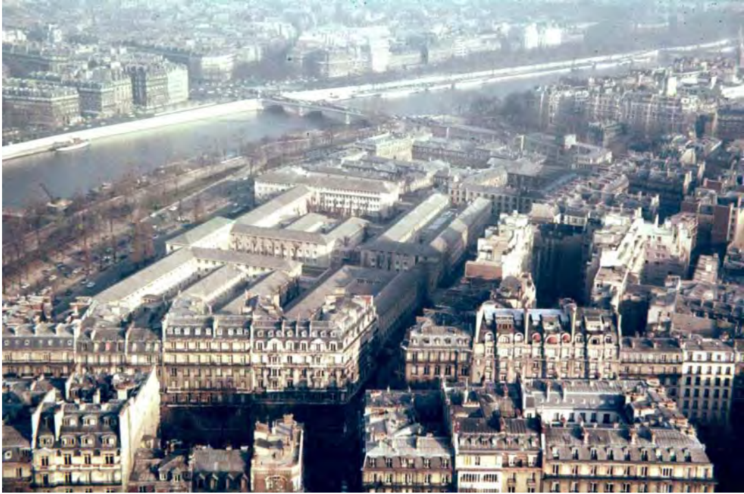
View from top of Eiffel Tower