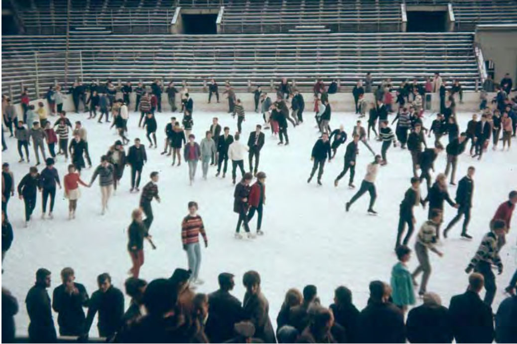
Ice Stadium, Garmisch