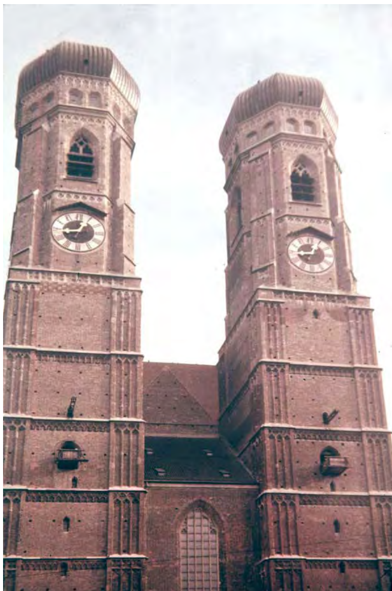
Munich Cathedral, Frauenkirche