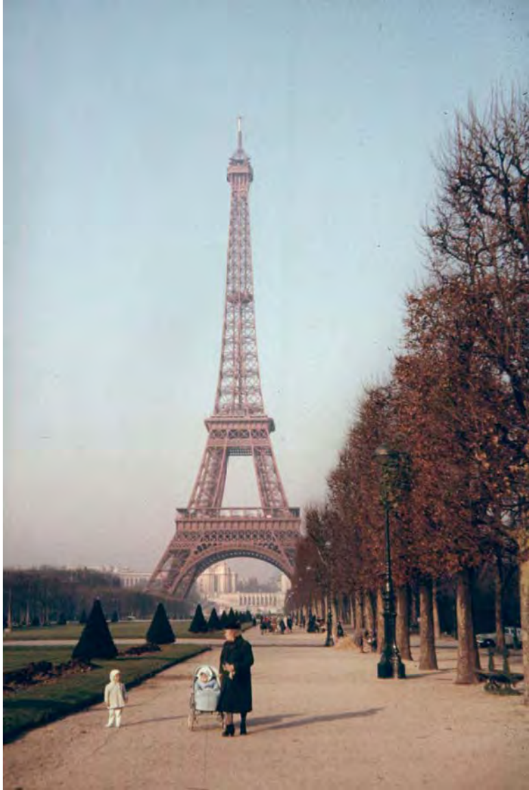
Champs de Mars