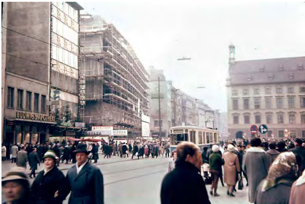
Munich street scenes