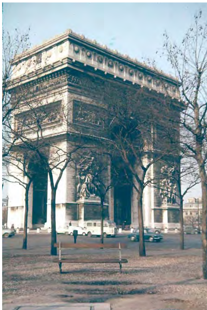
Arch of Triumph