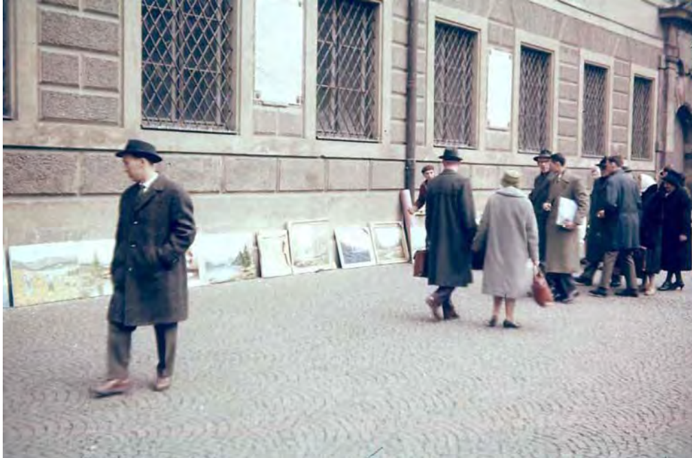
Munich street scene