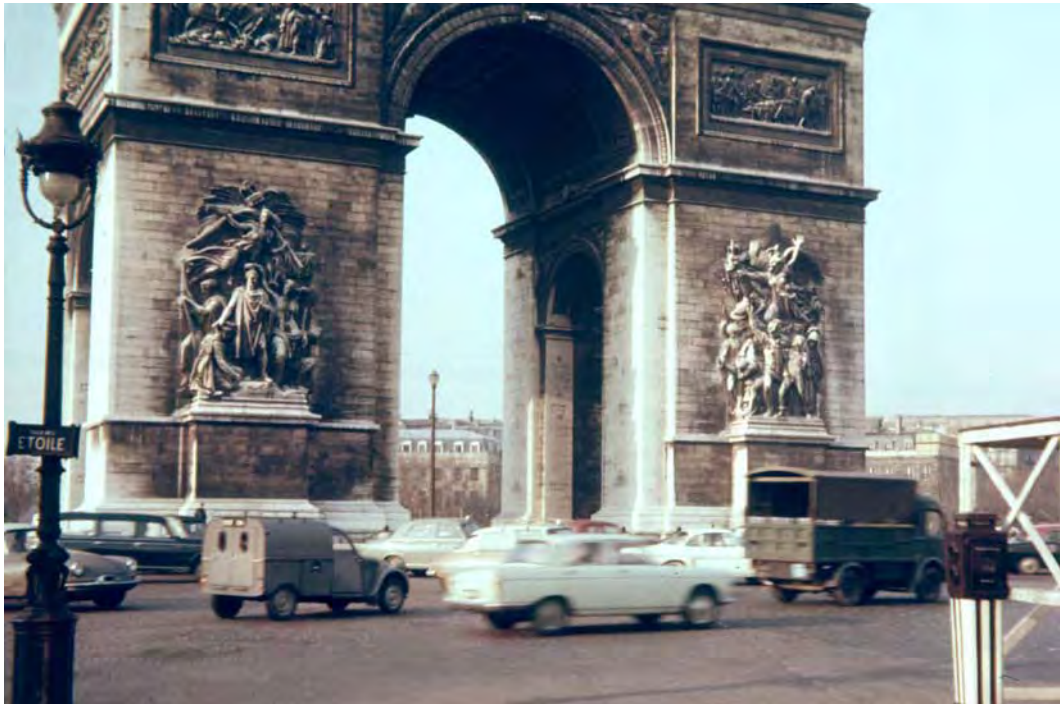
Arch of Triumph