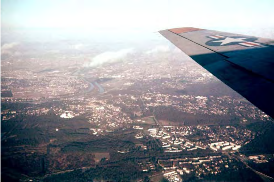
Approach to Paris