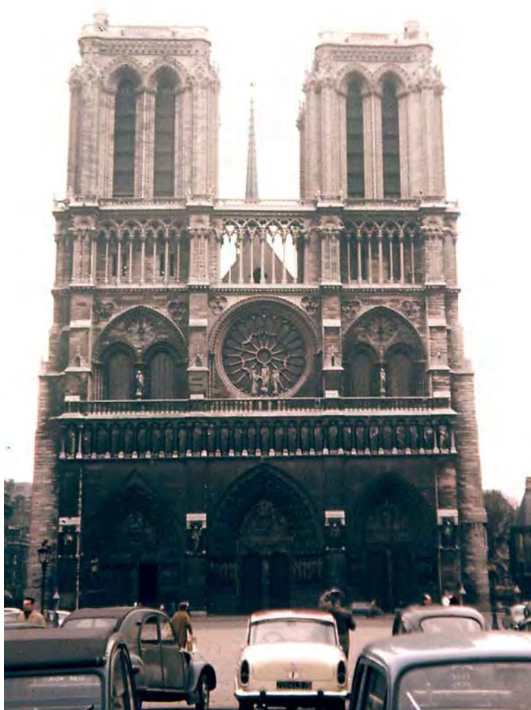
Notre Dame Cathedral