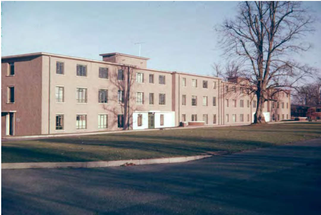
Block 5 at Greenham