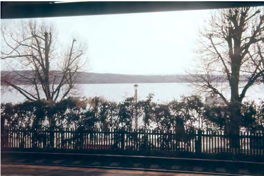
Lake between Munich and Garmisch