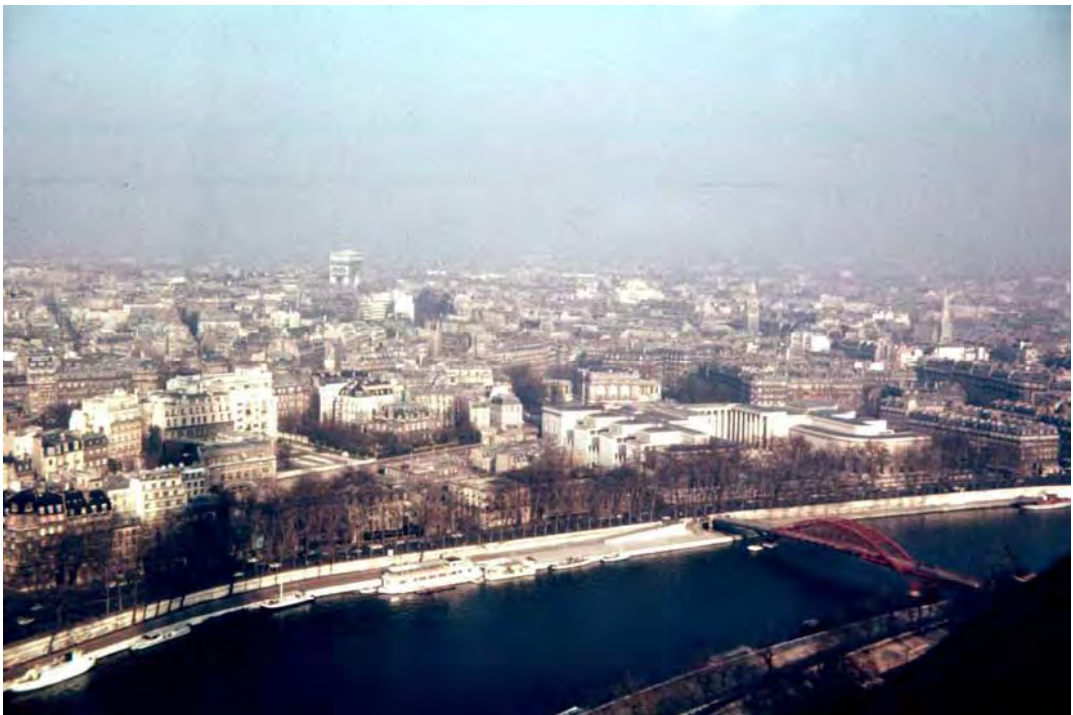
View from top of Eiffel Tower