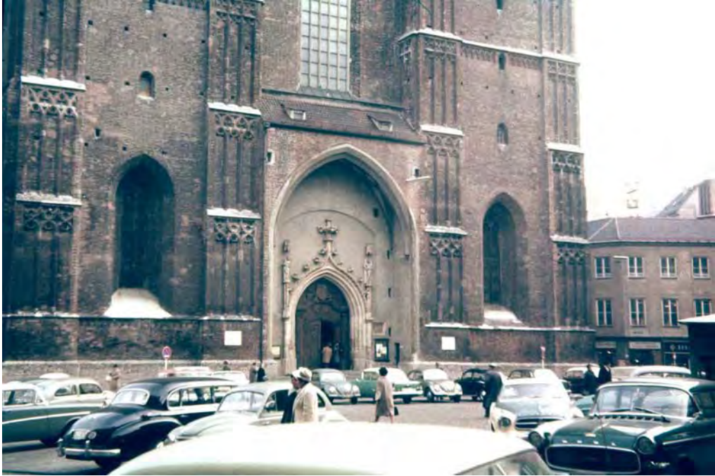
Munich Cathedral, Frauenkirche