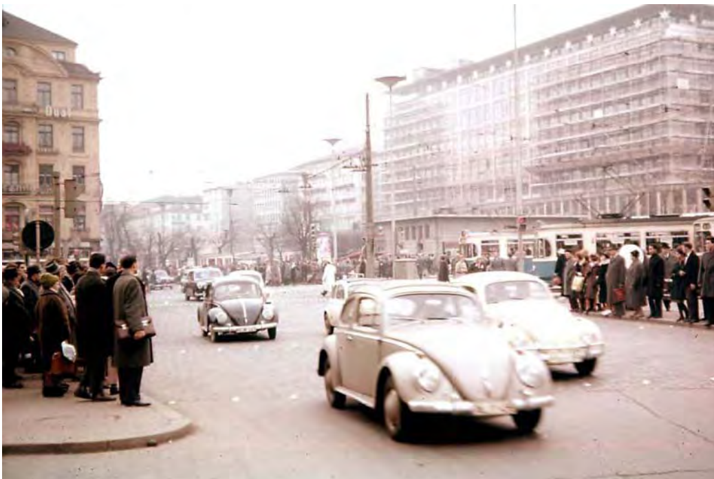
Munich Street Scenes