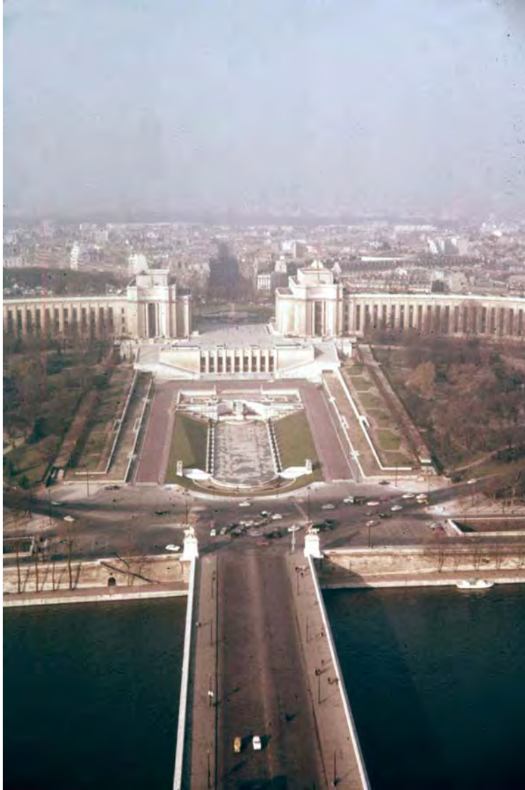
View from top of Eiffel Tower