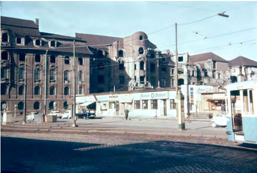
Bombed-out building near Munich rail station