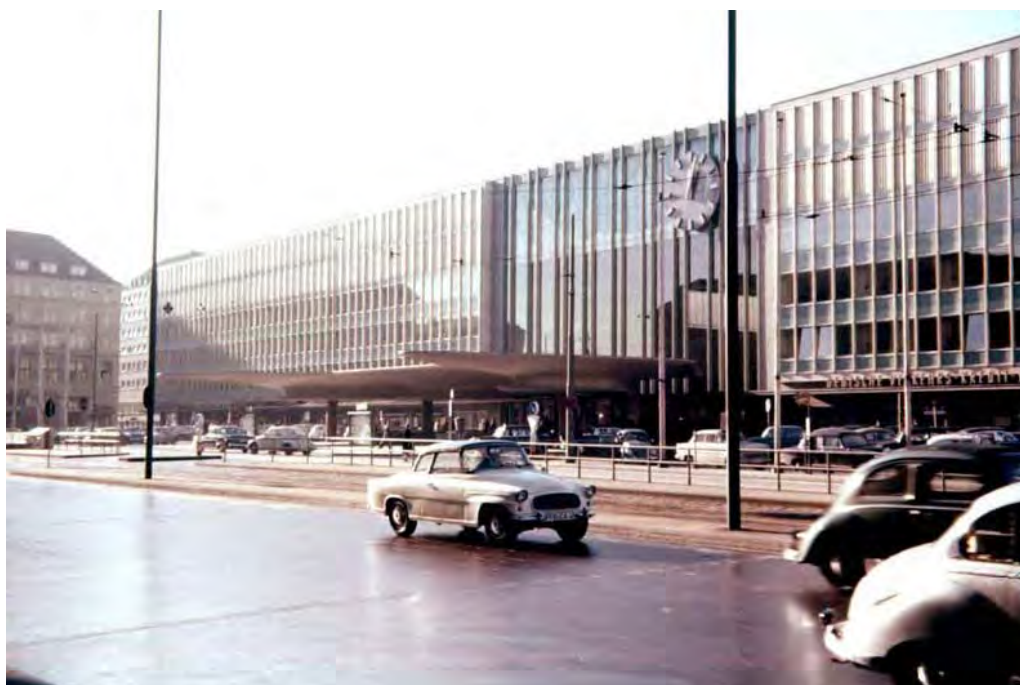
Munich Street Scenes