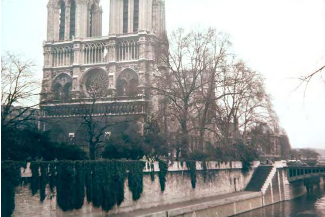
Notre Dame Cathedral