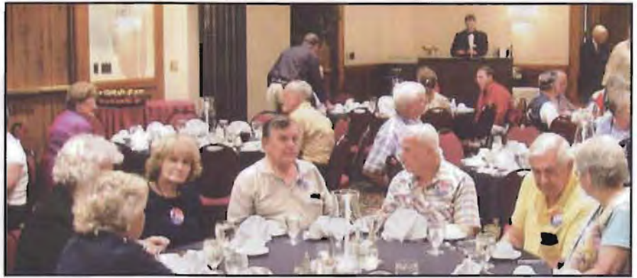
Above & below, food & fellowship around the tables at the welcoming buffet.