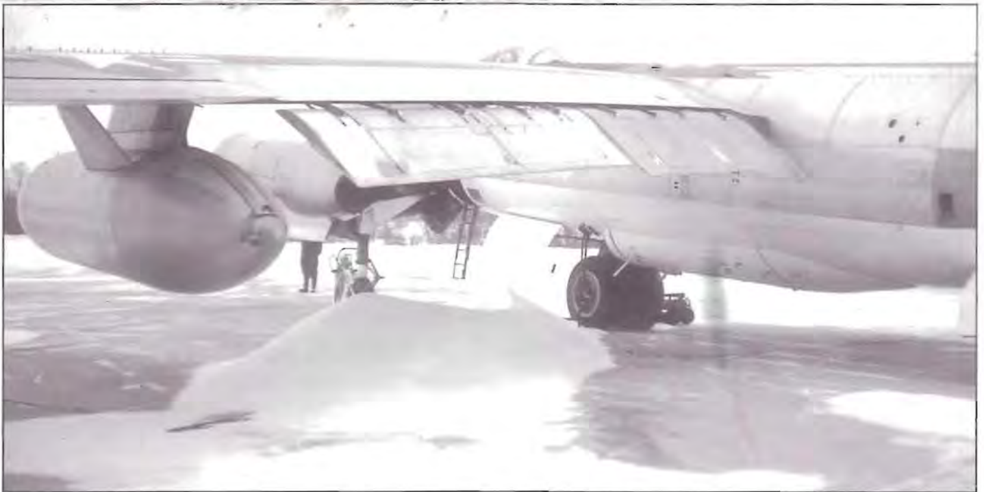
An EB-47E, 53-1929, of the 301st BW sits on alert in the snow and under the cold, gray skies of Brize Norton. 1929 was a Lockheed-built airplane delivered to the 2nd BW in 1956, then to the 301st from 1959 until 1963. It finished service with the 376th and was retired to Davis-Monthan on 17 February 1965.

Non Profit U.S. Postage PAID Brenham, TX 77833 Permit No. #84