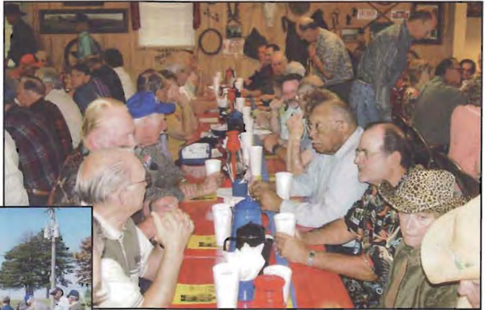
Left, waiting for the Kansas Aviation Museum tour. Above, the Prairie Rose Chuckwagon Supper and Western Stage Show.