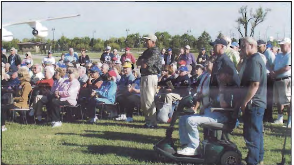
Above, the reunion crowd looks on during the dedication ceremony at the MAFB B-47.