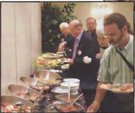
Above, the buffet line on Thursday evening. Right, the bus loads for the dedication at McConnell AFB