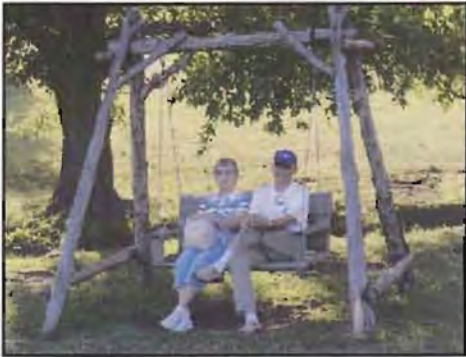
Swinging at the Prairie Rose