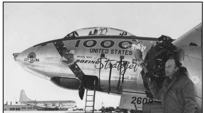
The 1000th B-47 after delivery to the 40th BW at Smoky Hill AFB.