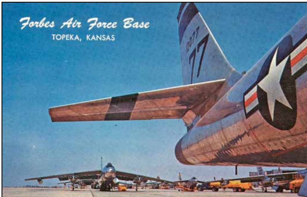
A 1950s postcard showing a ramp full of Stratojets. Most bases had postcards featuring their aircraft although some of them were rather generic.

2016 Reunion: Washington DC ~ 29 Sept-2 Oct See pages 6-7 For Details